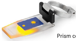
Prism coverplate with LED ORA-A1101