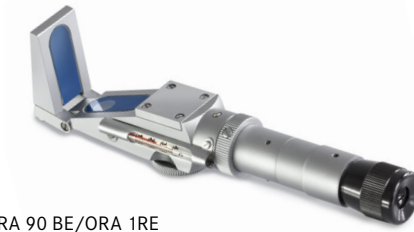
ORA 90 BE/ORA 1RE