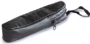
Leather bag ORA-A2103