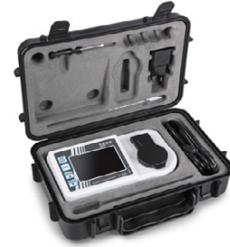
Transport and storage case