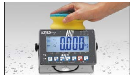
Thanks to the stainless steel design of the housing and platform with smooth surface, the scale is rust-free and easy to clean