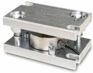
Fig. shows accessories, load corner 1 SAUTER CE Q42901, for further accessories please visit our online shop