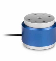
DC Y2 Alloy steel static torque sensor