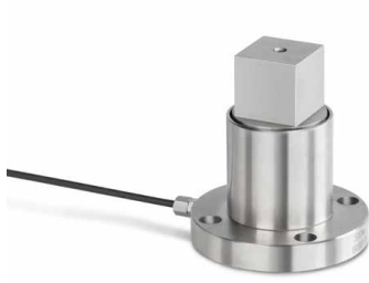
DC Y1 Alloy steel static torque sensor