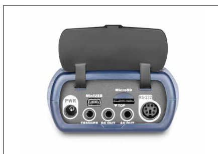
...and data transfer using MicroSD (4G) memory card (included in delivery), RS-232 or USB